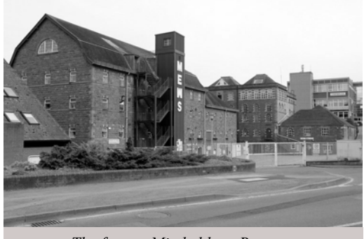
The former Mitcheldean Brewery

It was a talk with appeal for those interested in military matters, railway history and, of course, social history. The time flew by and in the chit-chat that followed there was high praise for the hours of research the project had obviously taken. No doubt it will be among the highlights of this winter's programme of events.