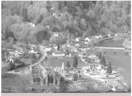
Tintern viewed from Devil's Pulpit

Stopping on the way at Tinmans Green, Redbrook. Redbrook Copper Works used ore brought from Cornwall via Chepstow and worked until 1740 when it closed down and the buildings were leased for the manufacture of tinplate. It is from this iron ore that the village got its name – the brook running down the valley through the village often ran dark red. Passing Whitebrook on the far bank of River Wye a jetty is visible beside the farm there. It was built specifically for the Whitebrook wireworks, founded about 1606, to bring iron in and wire out.