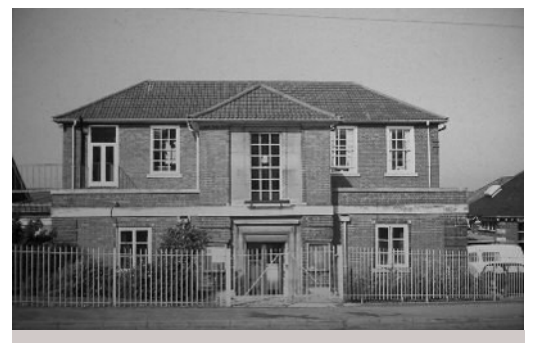
The Forest of Dean Mining & Technical School (later College) first opened in 1925 in Cinderford. It was one of the first adult education establishments in the Forest area.

We are talking to our website hosts and IT providers about how to improve our website so as to make it more user friendly and easier to use on tablets. Any ideas gratefully received. We still need a member who would be willing to help with loading content into the website and generally looking after it. You need no more than a general competence in using a website to undertake this role.