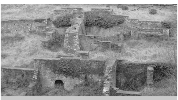
Darkhills Ironworks photographed before the conservation work started

One of the projects originally planned for the Foresters Forest landscape partnership project was to identify built heritage at risk and improve its chances of surviving for future generations. It has taken a number of years to get going, but this project is now underway and starting to show results. Way back at the beginning of the Foresters Forest project a short list of important standing remains, that were in need of repairs or improvement or better understanding, was drawn up and evaluated; from which a limited number of sites were chosen, as a cross section to represent our heritage assets, and to receive some attention. Funds are limited and the project was only ever intended to set standards for and raise the awareness of the plight of our historic remains and show what could be done. The hope being that local interest would help to continue the work and encourage people to take an interest in and help to conserve the above-ground archaeology. The sites selected include a lime kiln at Blakeney, a section of the Oakwood tramway at Bream, the Mill Hill drift mine entrance at bream, the iron works at Darkhills and its sister site the Titanic steel works, the pack horse bridge at Soudley, the stone lined water course at the blue rock trail, Lower Ruspidge and the chimney base and tunnel at the Trafalgar Colliery. It was intended that each would have clearance of vegetation, essential repairs and some small scale conservation works carried out.